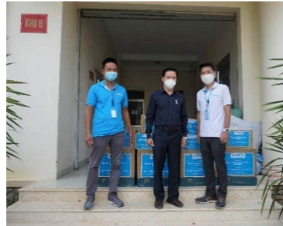
Leaders of Ninh Hoa town authority receive supporting package of medical supplies and equipment from VPCL

VPCL has also assisted Covid-19 prevention and control of local frontline forces through its in-kind support of medical supplies and equipment. The supporting packages have been handed over to Ninh Hoa Town Police and People's Committee, Ninh Phuoc and Ninh Tho communes People's Committees.